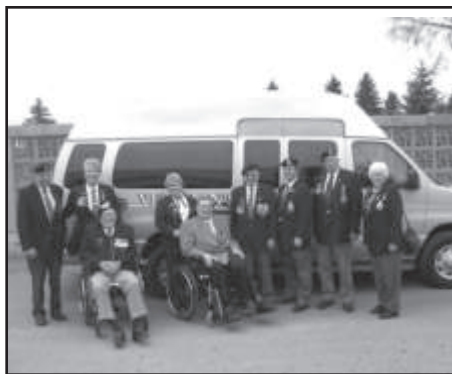
"Handing over the keys"

For many years, The Saskatoon Poppy Fund has provided ongoing funding for much needed equipment for Veterans at Sherbrooke and has also generously donated to many organizations and services around Saskatoon. Their thoughtfulness