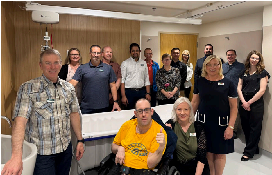
Residents, staff, donors and partners celebrating the new bath and shower room in Fourth Neighbourhoods.

The traditional Christmas lunch buffet for residents and families was sponsored in part by SIGA. Over the years, grants from SIGA to Sherbrooke Foundation have also supported spiritual care visits with Indigenous Elders and smudging ceremonies.