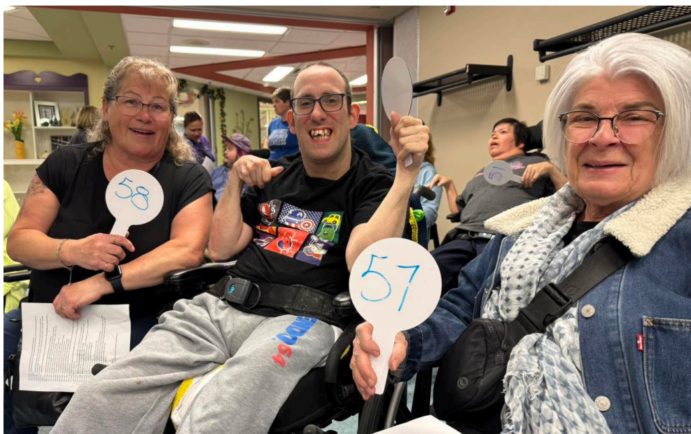
The Tawâw Centre was packed for our first live auction. Thank you to all the donors who contributed auction items.

Thanks to our professional auctioneer, our recreation team, the donors who contributed auction items, and all of the folks who bid at the Sherbrooke live auction. It was the first time we hosted a live auction, and the event was a big success with over $4,500 being raised for Sherbrooke's recreation programming. The live auction certainly brought a lot of joy and spontaneity to our community and we are grateful to everyone who donated auction items. It was so much fun to raise funds for recreation programming.